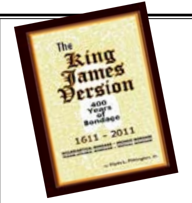
72 pp., PB See order form.

— Unsearchable Riches, vol. 5, pages 71-74