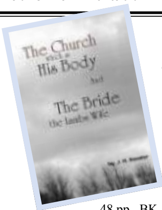
48 pp., BK

Suppose we treat this Greek word aiōn here as it is treated elsewhere in many texts, and translate it “ever” or “forever” instead of “age.” We would then read the text as follows: “Hast neither forgiveness in this forever, nor in the coming forever.” Or, if we were to use the word “endless” we would then read, “Hast neither forgiveness in this endlessness, nor in