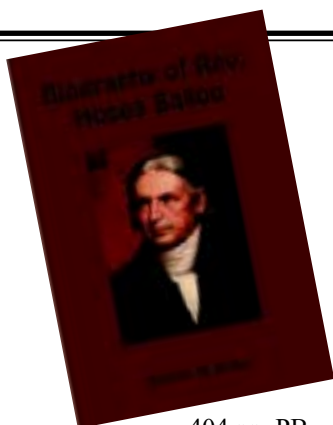
404 pp, PB